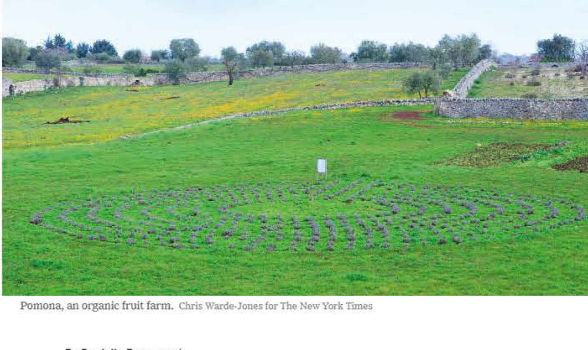
Pomona, an organic fruit farm.