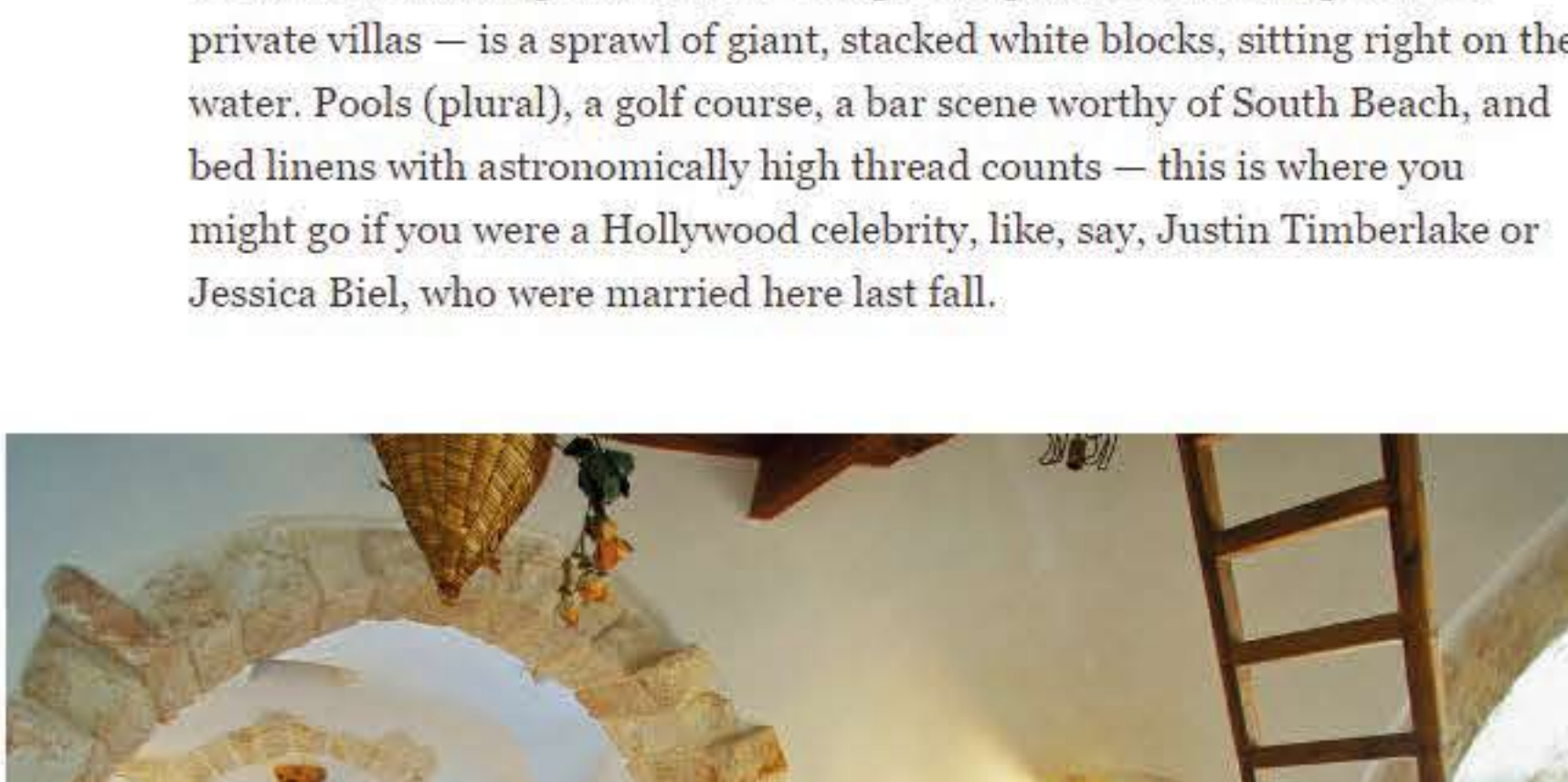
Inside Acquarossa.

If, on the other hand, you're looking for luxury and lots of it, try Borgo Egnazia, a masseria, or fortified farmhouse. The resort — consisting of a 69-room main building, a 92-room "village" of apartment buildings and 28 private villas — is a sprawl of giant, stacked white blocks, sitting right on the water. Pools (plural), a golf course, a bar scene worthy of South Beach, and bed linens with astronomically high thread counts — this is where you might go if you were a Hollywood celebrity, like, say, Justin Timberlake or Jessica Biel, who were married here last fall.