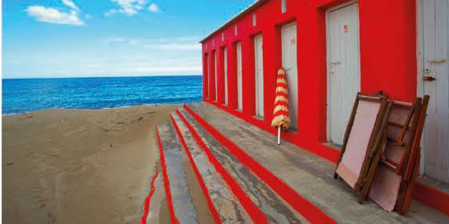
A beach in Puglia.

But according to my Italian friends (the kind who live in Italy), we had it all wrong. Puglia, they told me, is far better in the winter. Granted, it's too cold to swim, but the food is tastier, the shops are emptier and the prices are lower. And the lack of attachment to the beach encourages exploration of the area's inland charms. It's like discovering an entirely new Italy — or at least an Italy that is only populated by Italians. If you are planning your summer trip now, here's my advice: wait. The off-season, October through April, is the time to go.